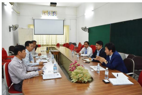
Meeting at Ministry of Planning