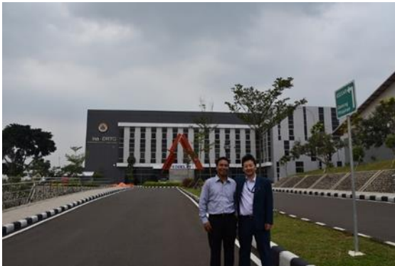
BNPB office, on the outskirts of Jakarta (with training facilities and distribution base)