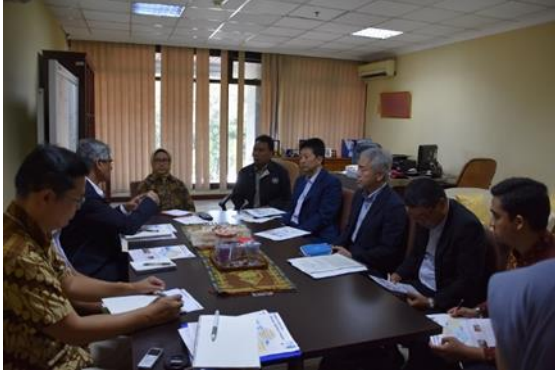
Discussion in BAPPANAS