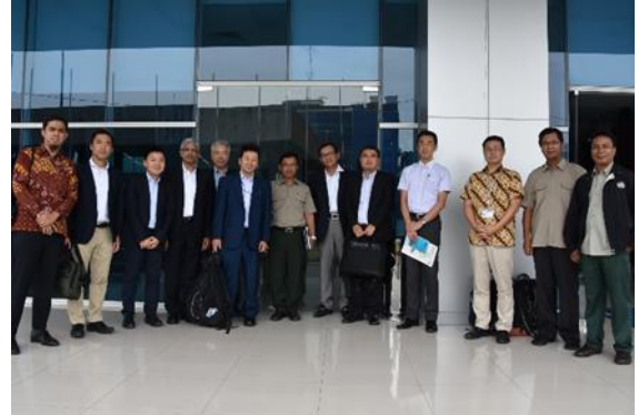
With the staff of BNPB